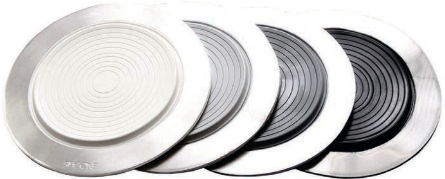
FDA White High Temp Silicone

Drywall • Sidewall Applications • Stucco Walls Corrugated Metal Sides • Roof Penetrations