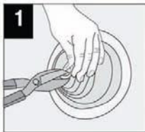
1 Choose pipe opening and trim

This universal flashing has been designed to fit virtually all panel configurations. Sleeve flexibility absorbs vibration and pipe movement caused by expansion/contraction. Easy on-site customization can accommodate all normal installations.