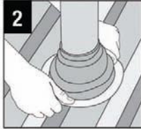
2 Slide over pipe